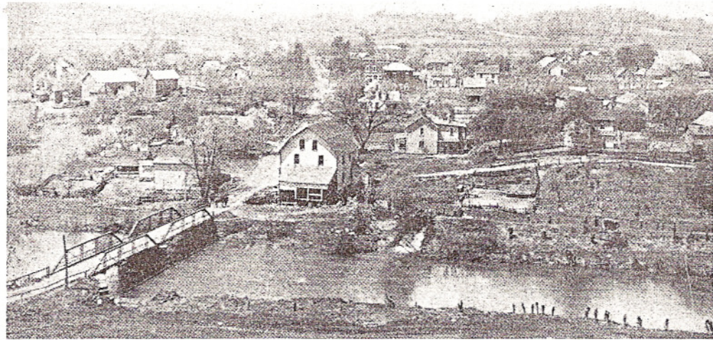
Birds eye view of South Side of East Sparta

announced a new invention called friction rollers. This is the largely forgotten forerunner of Canton's great bearing industry.