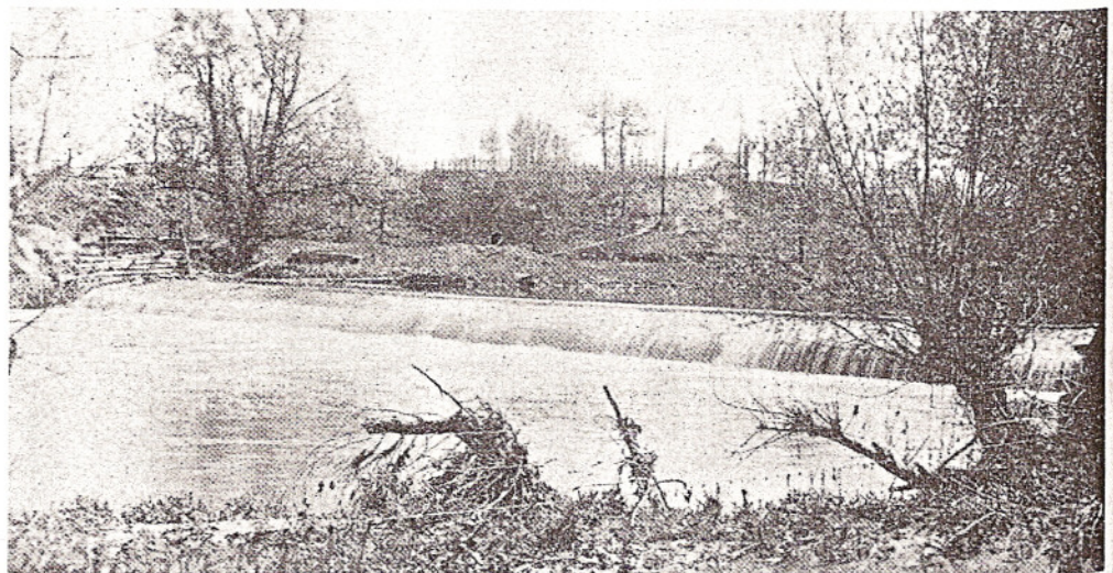
East Sparta Dam